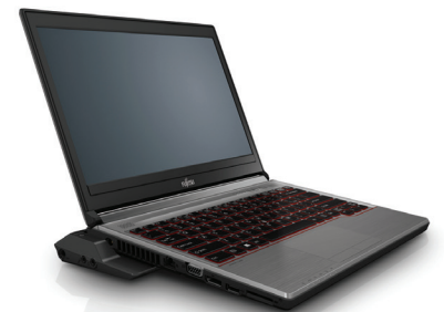
Shown with optional Port Replicator